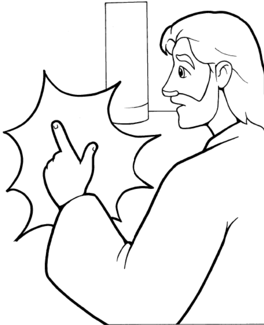
Jesus Appears to the Disciples